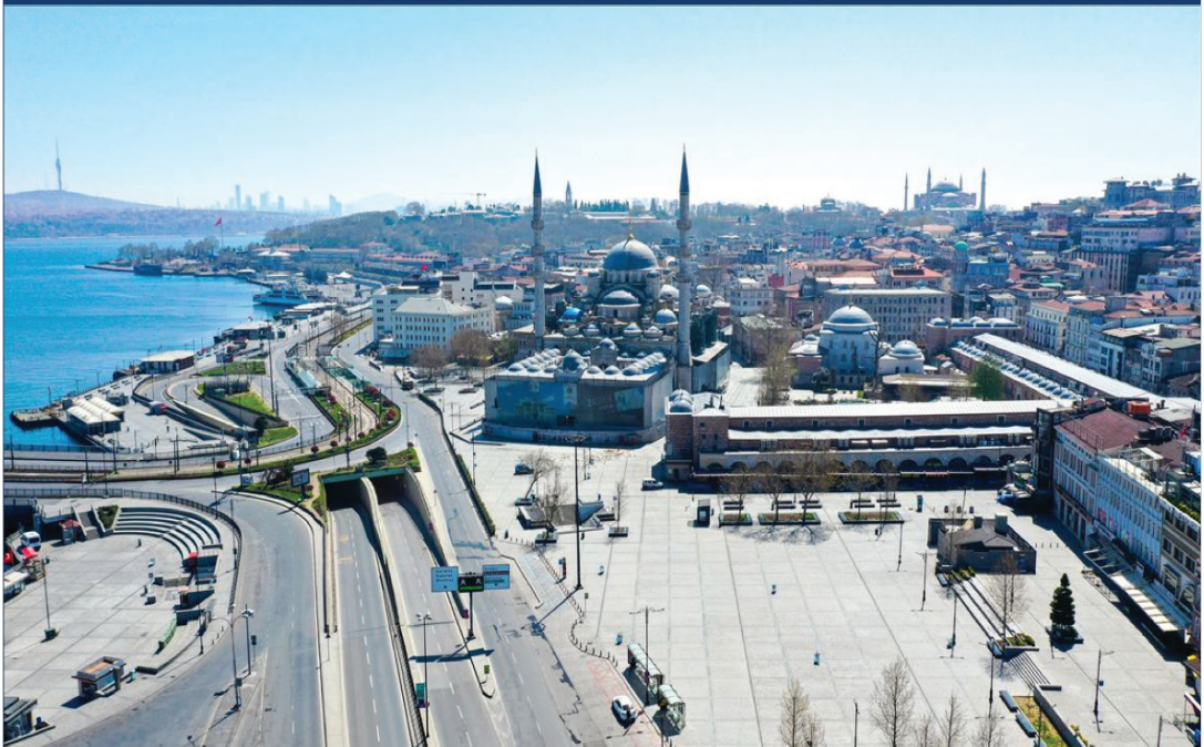
FIGURE 1. THE EYÜP SULTAN MOSQUE AND THE VACATED SURROUNDING SQUARE AND ROADS IN ISTANBUL ON APRIL 18, 2020, DUE TO THE WEEKEND CURFEW IMPOSED TO STEM THE SPREAD OF COVID-19.