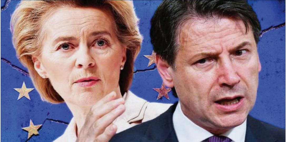
FIGURE 4. EUROPEAN COMMISSION'S PRESIDENT URSULA VON DER LEYEN (LEFT) AND THE ITALIAN PRIME MINISTER GIUSEPPE CONTE (RIGHT).